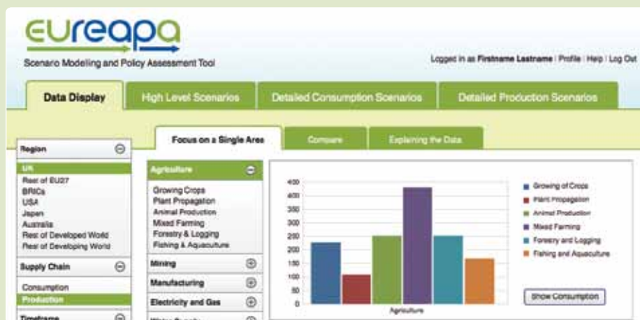
Please note that development is ongoing and the final look of the tool will be subject to change.

The design of the EUREAPA tool helps EU policy-makers and Civil Society access and manipulate a vast amount of information relating to the environmental impact of consumption and production, in order to prioritise and evaluate intervention into particular areas.